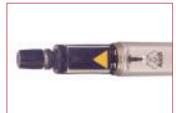
Choice of phantom power supply or internal 9 V battery