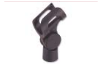
SA 63 stand adapter