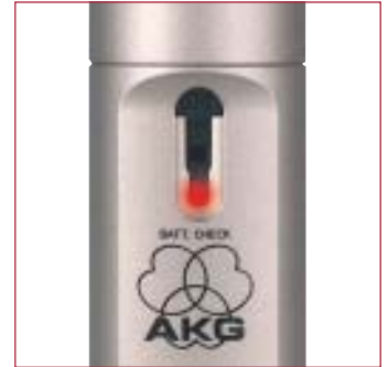
Battery status LED: Battery ok – LED blinks briefly