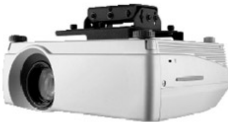
RPA UNIVERSAL TOP