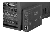
PJ-Net Organizer POA-PN40 (option)

These projectors can be connected to a computer network via the PJ-Net Organizer (POA-PN40, sold separately) for management and control capabilities. Projectors located in several different locations can be controlled from a single computer using your normal web browser - there is no need for any special software.