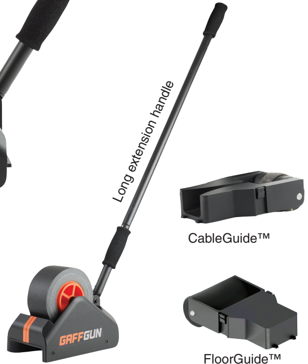
GaffGun™ Bundle w/3 CableGuides & FloorGuide