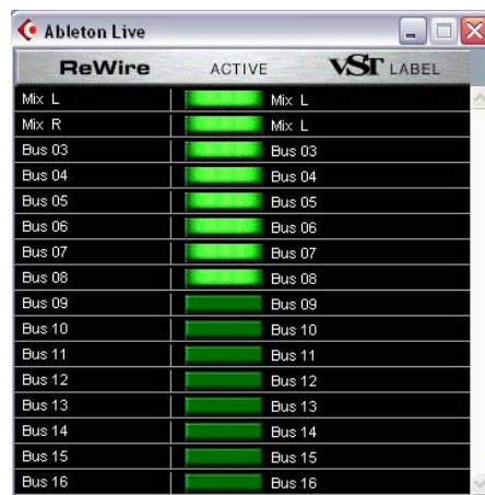
Rewire Setup Panel (here with Ableton Live)