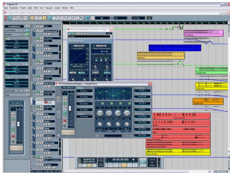
Project Window with Inspector, Transport Bar, Channel Editor and VST Dynamics plugin.